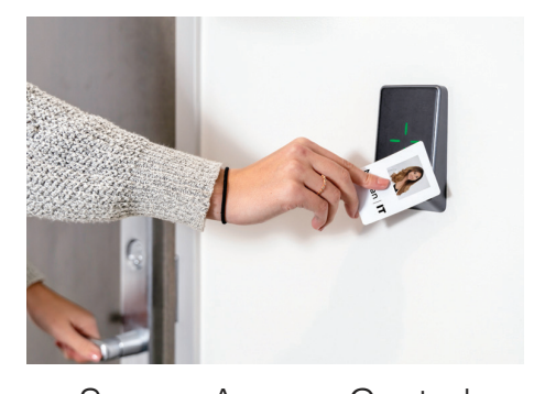
Secure Access Control