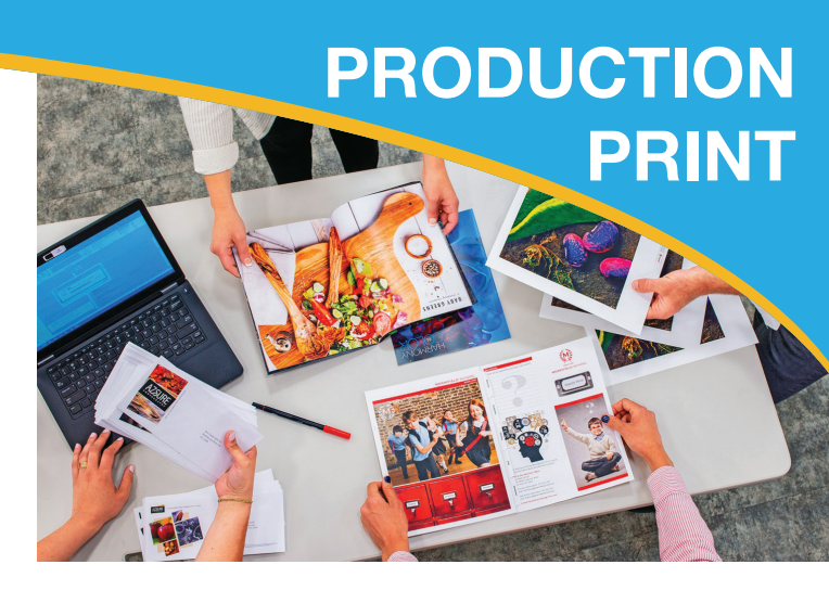
Ultra HD Resolution Technology provides 4X more pixels than the press standard, without slowing down.